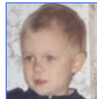
Sergey Chronic myeloblastic leukemia